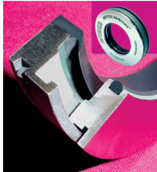
The patented AirShield™ design with a flexible Viton lip seal eliminates 100 percent of contamination from coolant ingress and spindle contamination in both dynamic and static conditions including cool-down.

New greases, specifically designed for higher speed spindles, allow for higher permissible operating speeds, lower operating temperatures, and longer spindle life without the necessity of using inherently less reliable air/oil lubrication systems. Improvements in bearing materials and geometries allow for higher load capacities, speed, and precision, while providing lower operating temperatures.